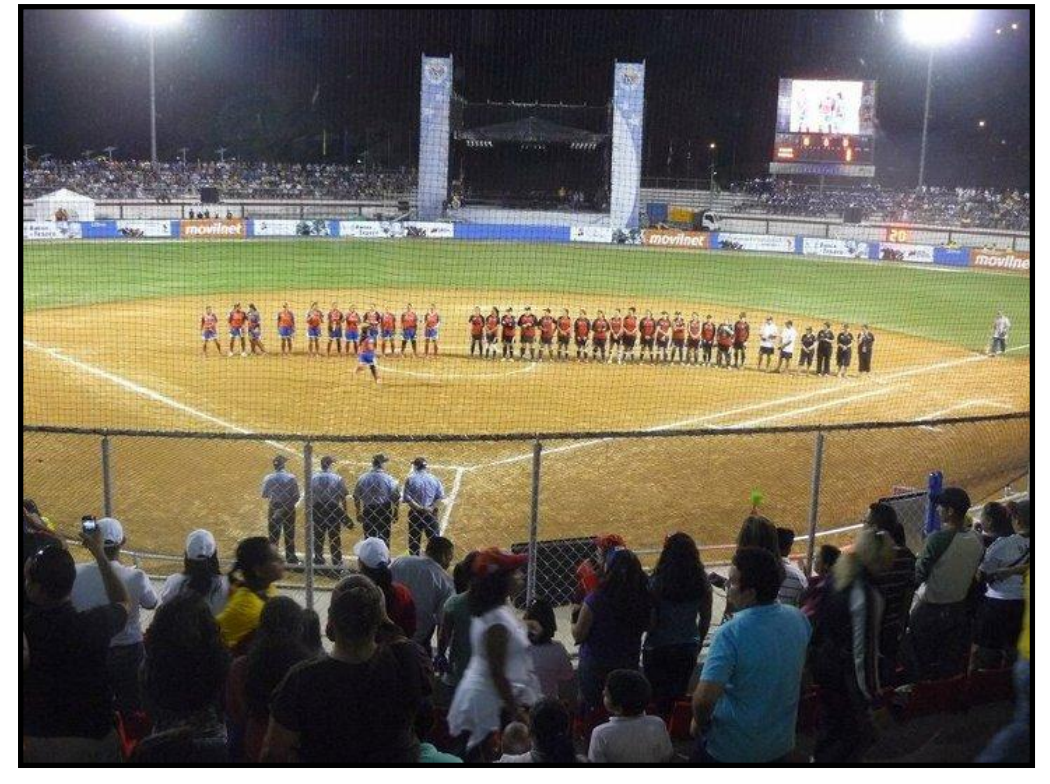
White Sox vs. Venezuela - Walk Out. Capacity crowd of 5000 Venezuelan Softball Fans