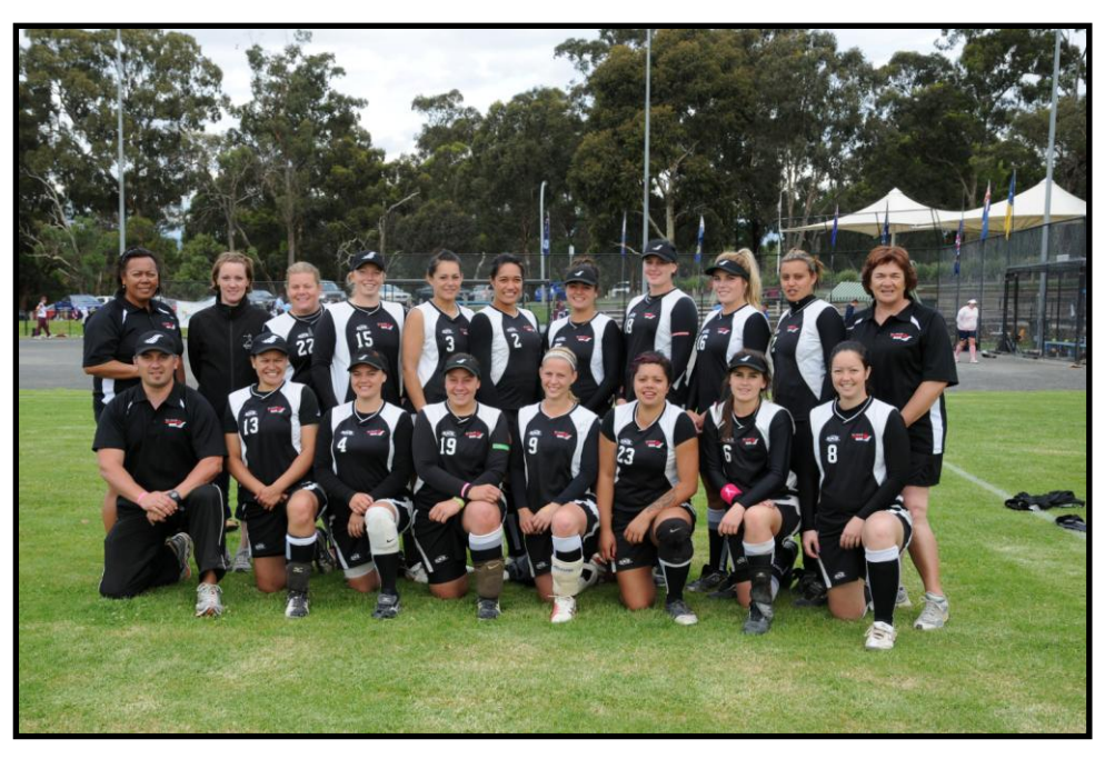
Above: New Zealand White Sox Melbourne Weber-Edebone Team